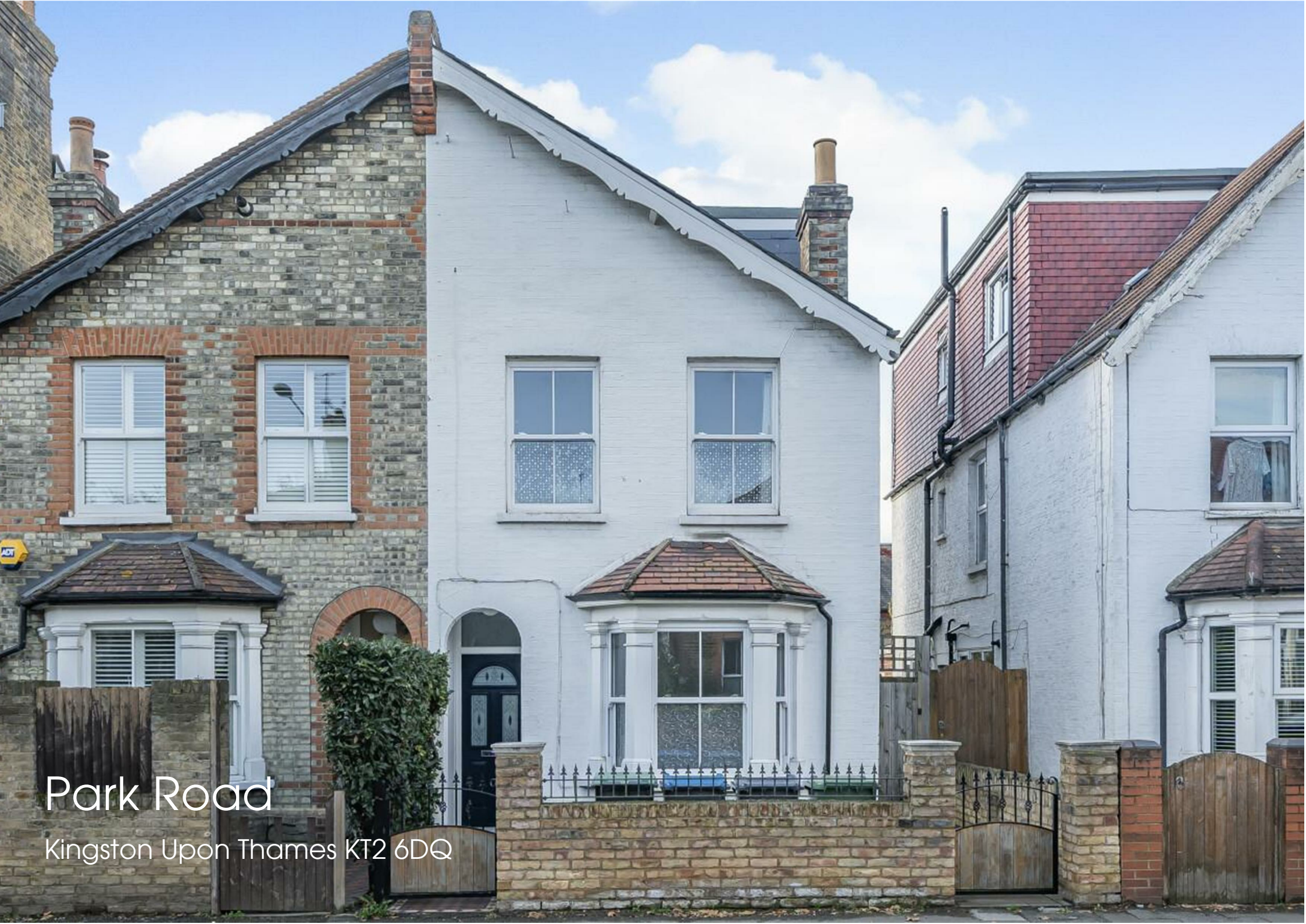
Park Road Kingston Upon Thames KT2 6DQ